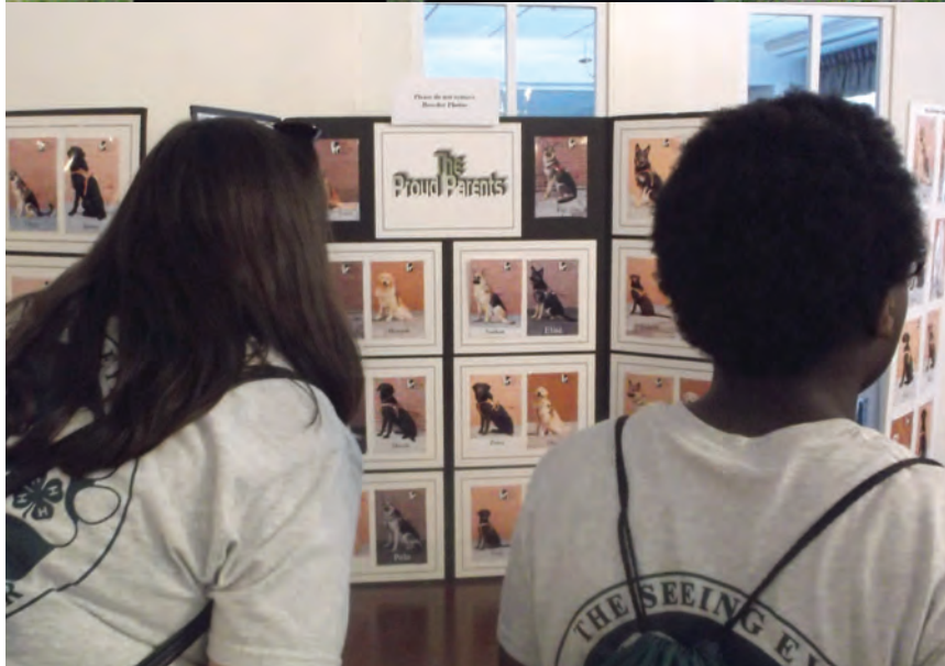
Puppy raisers look at photos of their puppies' parents at Family Day.