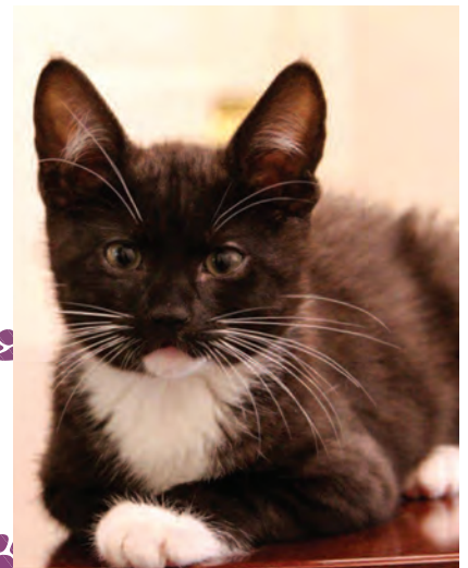
Crosby is a black cat with white on his chest and paws.