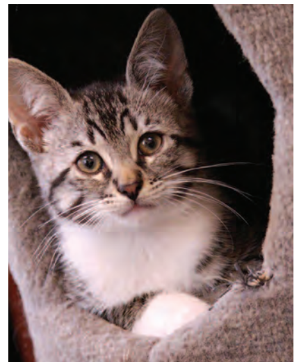
Nash is a gray cat with black stripes.