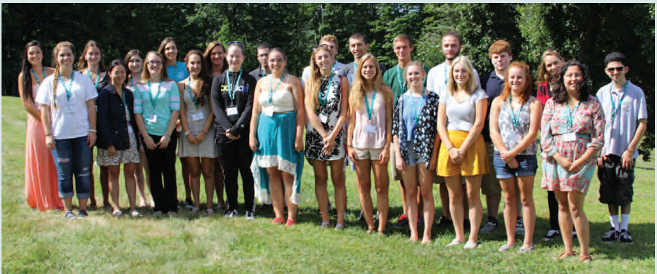
The 2015 Seeing Eye Scholarship recipients.

The Seeing Eye welcomed more than 1,300 people to campus on August 22, 2015, and awarded 55 students with Puppy Raiser Scholarships. All the recipients are college-bound high school seniors who raised at least two puppies for The Seeing Eye, including one during their junior or senior year, and who attended at least 70 percent of their puppy club's meetings and activities. The scholarships are not based on academics, but rather on community service. Each applicant writes an essay about the effect being a puppy raiser has had on his or her life.